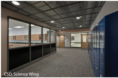
CSD, Science Wing