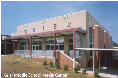
Grier Middle School Media Center