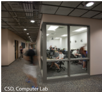
CSD, Computer Lab

all learners, provides for health, safety, and security, makes effective use of available resources and is flexible and adaptable.